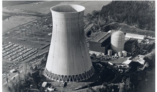
Trojan Nuclear Power Plant Completed, 1975.