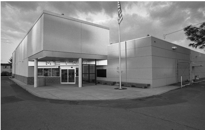
Old Safeway training center.

The NECA/IBEW Local 48 Electrical Apprenticeship Training Program offers apprentices the most-respected and experienced instructors. With such a technologically advanced facility, the result is highly skilled and productive electricians.