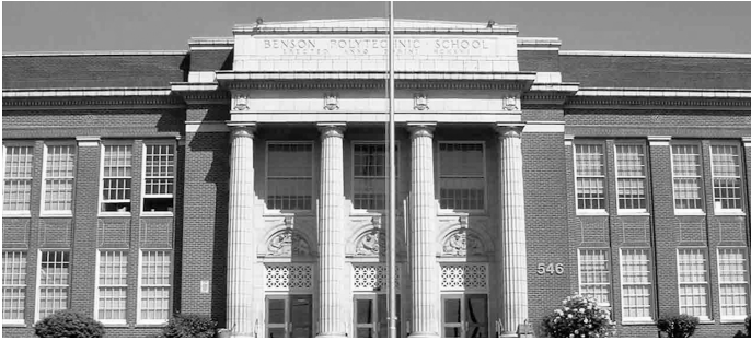
Benson High School.

By 1975, IBEW Local 48 membership was approaching 2,000 and the Metro JATC apprenticeship increased 60%, to 300 students, outgrowing Benson High School.