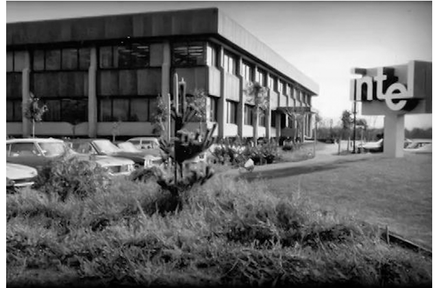
Intel building Washington Co. 1974

As the Portland metro area continues to grow and welcome in big projects, NECA/IBEW Local 48 electricians and contractors will be there to take on the job, to help our community prosper.