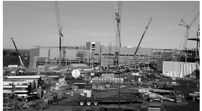
New Intel building being constructed.

As the technology market evolves and changes, Intel must change, too. Not only change their products to fit new technology trends, but also change relationships and