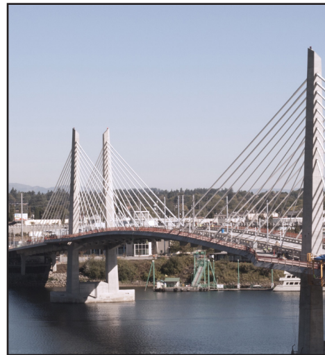
Tilikum Crossing — Portland, OR 2014

The 1920's brought flapper girls, jazz music, penicillin and the opening of the Burnside Bridge.